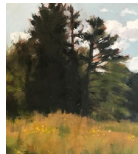
Sandy Haynes Fields of Goldenrod